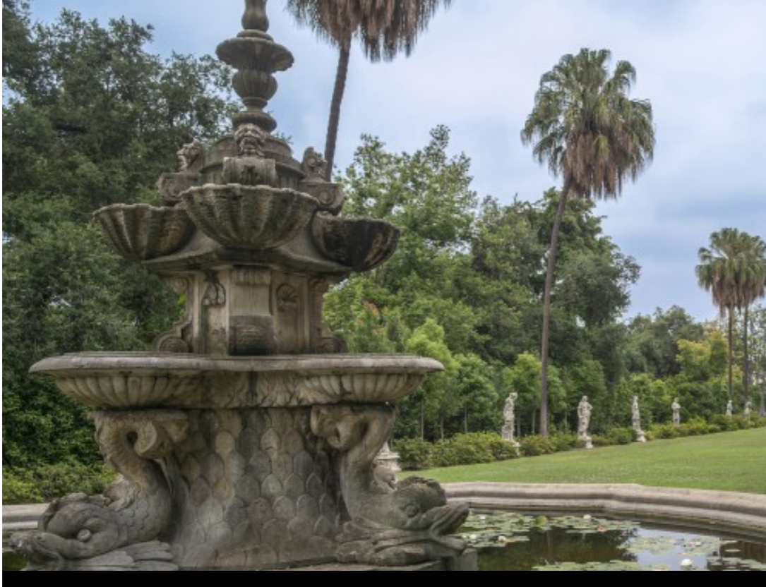
GARDEN SCULPTURES & FOUNTAINS